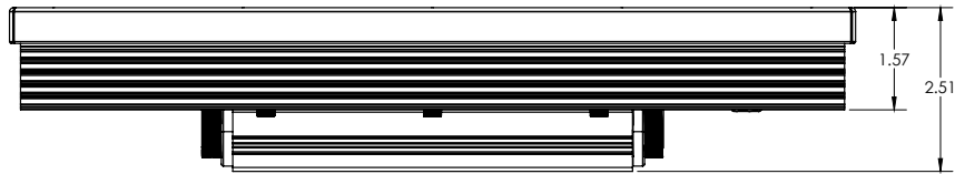
2 ELEVATION VIEW